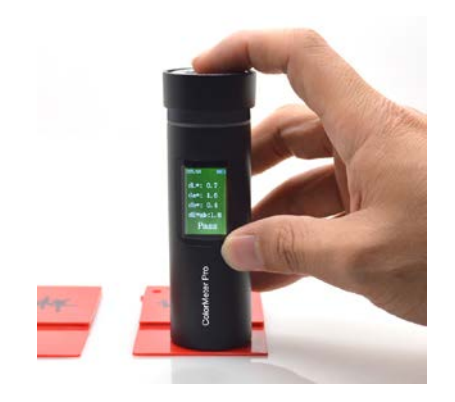
Operate on Instrument