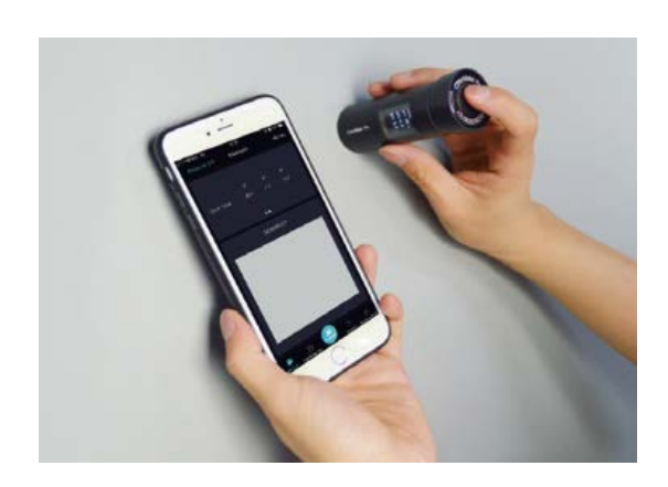
Operate from APP